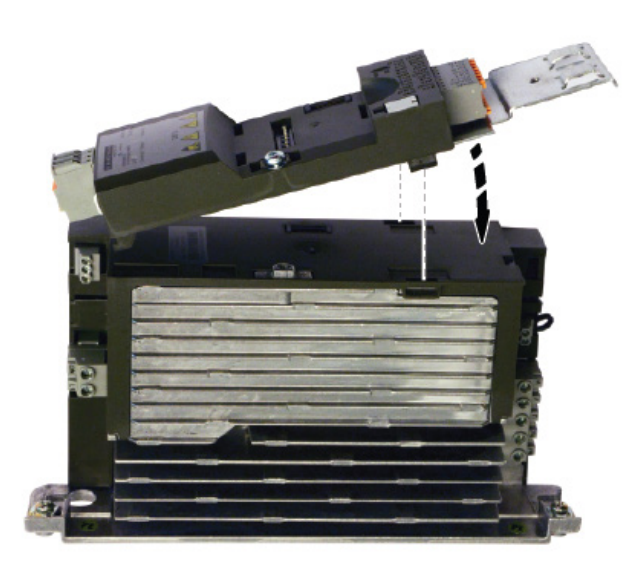
3. Fix it with a securing screw.