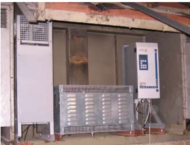
The retrofit involved installing a new electronic control system based on the Emotron VFX variable speed drive, as well as replacing the eight drive motors.