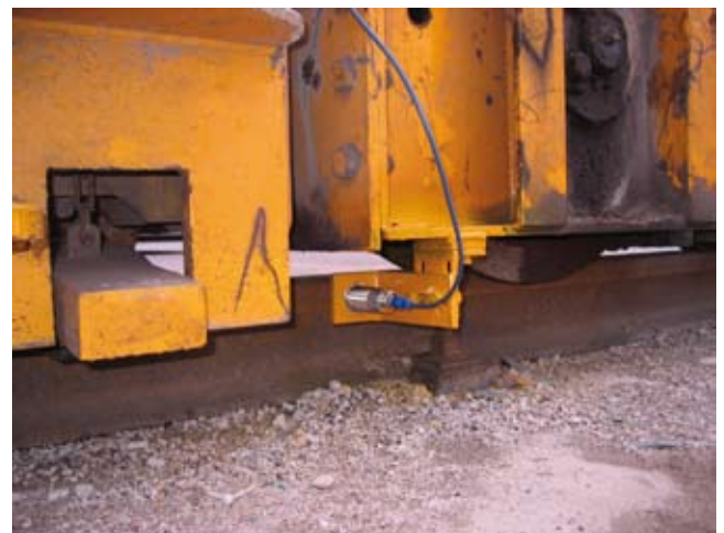
Contact between the wheel flanges and the rails is prevented. The accuracy of the signals from the four ultrasonic sensors is vital to the operation.