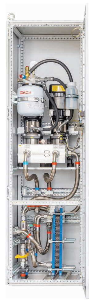
Cooling section water to water with redundant pumps.

Max water pressure in - 4 bar Max water inlet temperature - 35°C Pipe couplings for in- and out-water - G1"