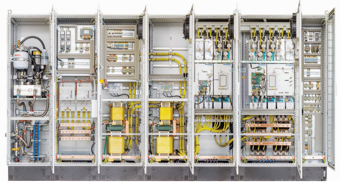
Complete 1.1MW cabinet with water-to-water cooling. Cabinet sections from left to right : 1) Cooling 2) Main switch 3) and 4) LCL filter 5) AFR with 4 PEBBs 6) VSI with 5 PEBBs 7) Aux section.

The mechanically robust construction of the Emotron AFE is very easy to install and use.